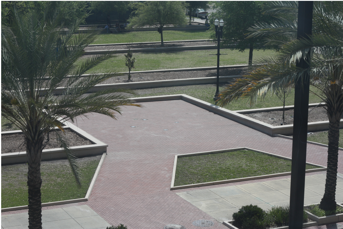
Main Street Park: Entrance of Park (placement of focal point piece)