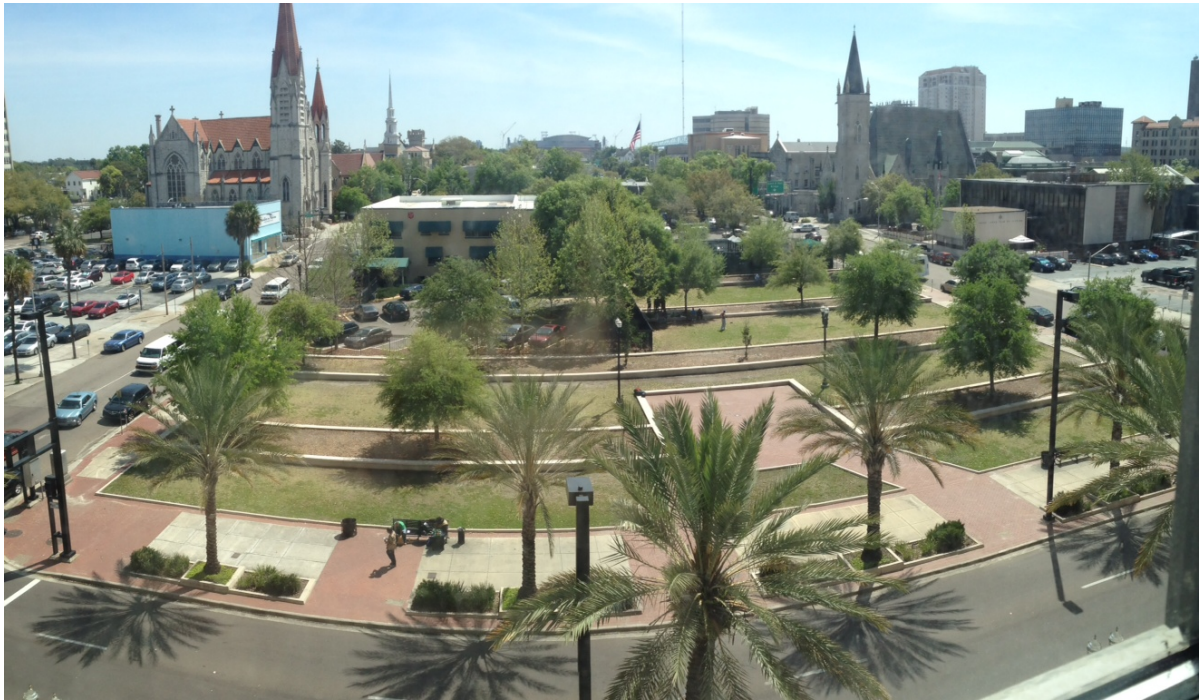
Main Street Park: Entrance of Park (placement of focal point piece)