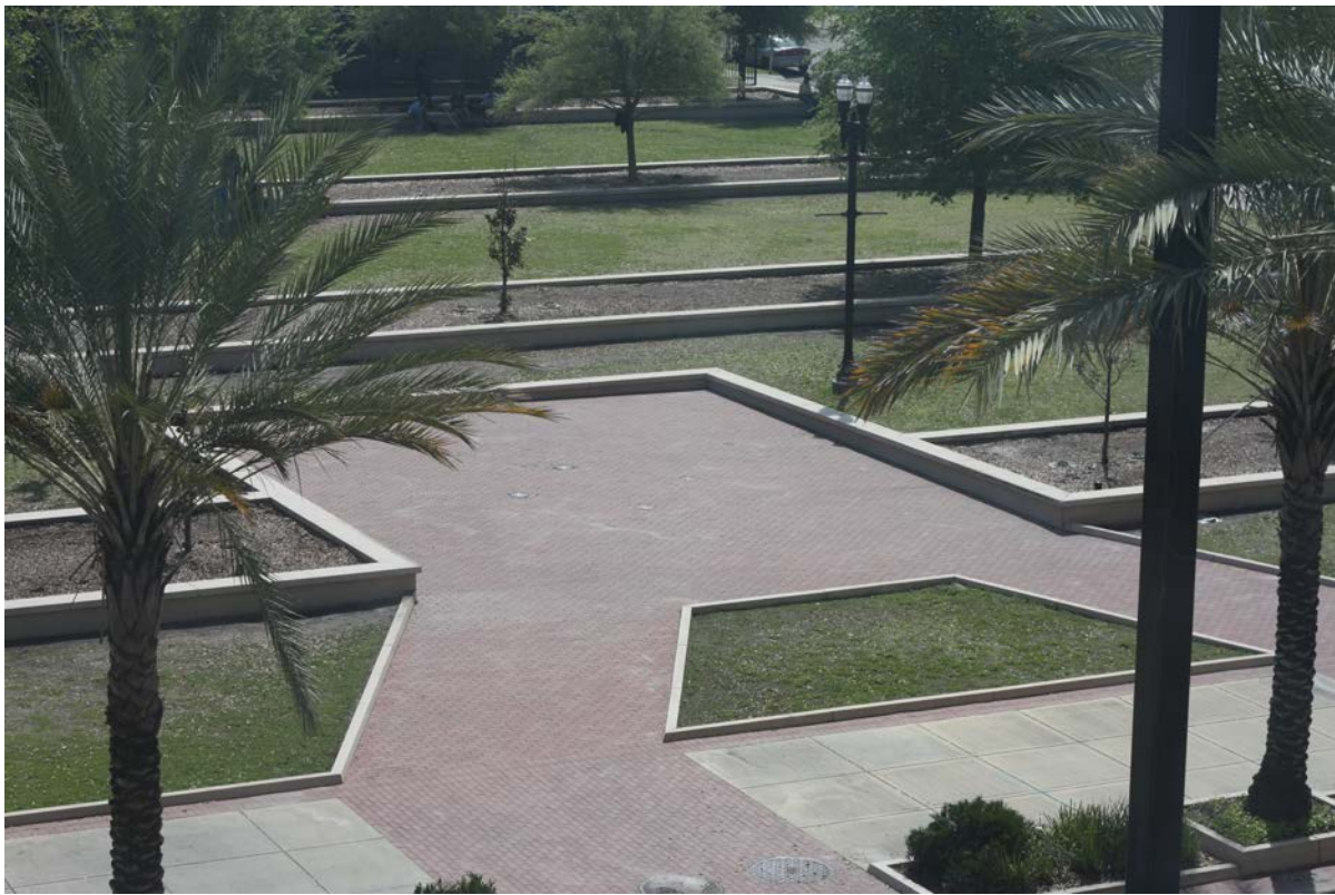
Main Street Park: Entrance of Park (placement of focal point piece)